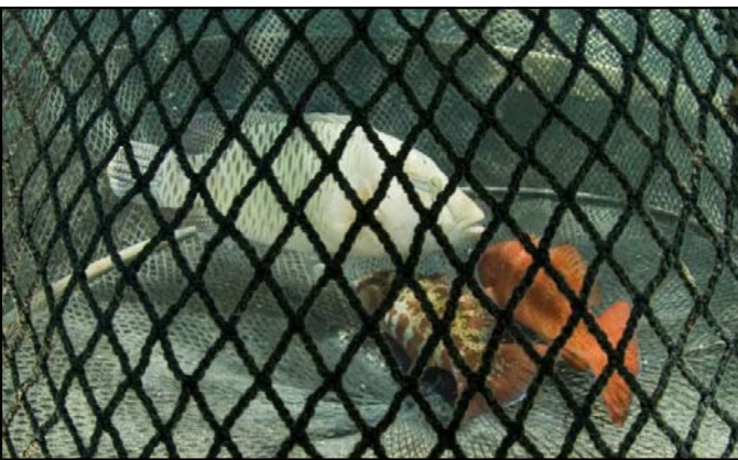
A napoleon wrasse inside a fishpen with two groupers in the waters of Balabac Strait.