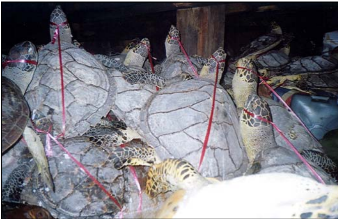
Slaughtered hawksbill ready for processing onboard a poacher's boat (photo courtesy of BFAF).