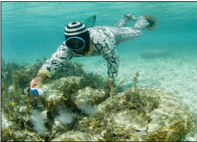
Use of poison / cyanide to catch aquarium fishes is one of the major threats to biodiversity within the Seascape.